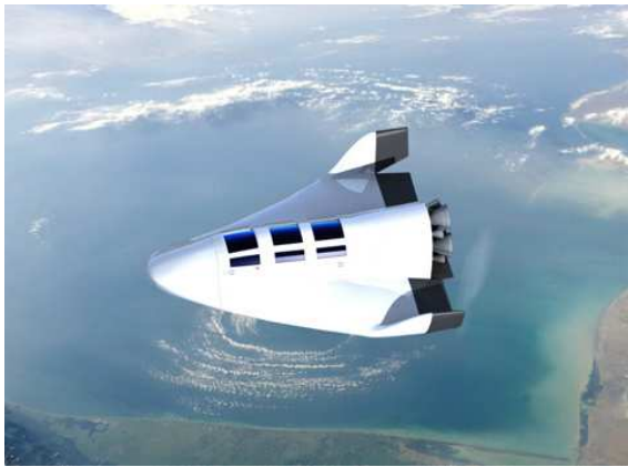
Fig.5 - A panoramic experience above the Earth

ACE is convinced that its suborbital reusable spaceship will create a growing enthusiasm among its users and will provide a highly appreciated instrumental for the public support of manned exploration in Europe.