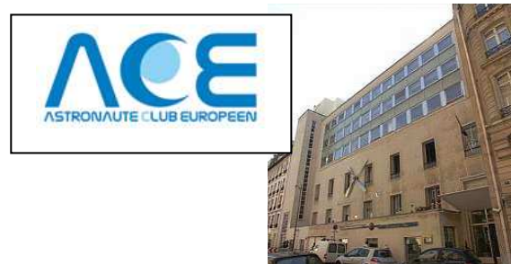
Fig. 1 - The French designer Jacques Dress created the logo of Astronaute Club Européen. The head office of the association is located in the "Aéroclub de France".

© Copyright 2006 by Astronaute Club Européen. Published by the IAF, with permission. Released to IAF/IAA to publish in all forms.