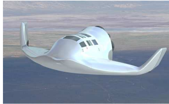
Fig.4 - The VSH returning to runway...

Spaceflight operation will be performed from Europe. ACE is considering numerous locations for its home base and launch site, with respect to operational and environmental constraints.