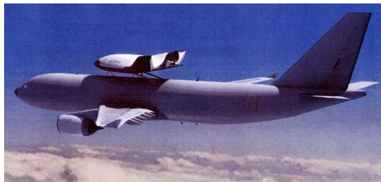
Fig.2 - The Vehra Air-Launch concept has been adopted for the VSH

European engineers have participated in many aspects of reusable launch and space vehicle development (Hermes spaceplane, X-38, TSTO studies, etc.), either for national or international projects. In particular, Dassault Aviation has applied, since 1998, this experience to the design of a new space transport system based on an airborne reusable hypersonic vehicle dubbed Vehra 1 . Launched from the back of a european commercial jet (Fig.2), its own rocket propulsion system boost it into suborbital trajectory. The airborne launch technique provides a performance edge over conventional ground-launched boosters, as well as eliminating the most serious restrictions due to launch and recovery infrastructures.